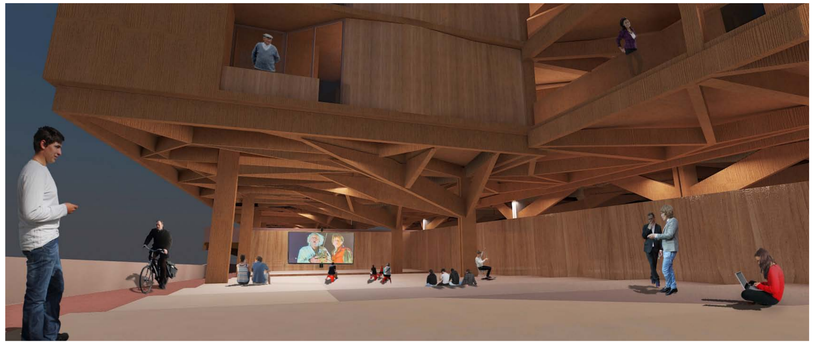
Intermediate floor perspective